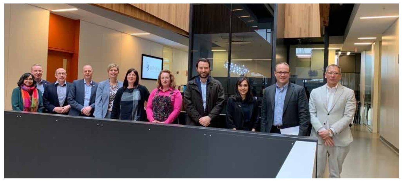
The UK delegation with colleagues from AdMare Bioinnovations and Health Canada

as part of the Government of Canada's Networks of Centres of Excellence<sup>68</sup>. CellCAN's mission is to improve the quality, safety and feasibility of cell and gene therapy in Canada through optimal manufacturing practices. The emphasis is on building a network, advancing regulatory standards, effective outreach, and positioning Canada as a world leader. There are parallels with some UK networks, in particular the ATMP Manufacturing Community (amc)<sup>69</sup>.