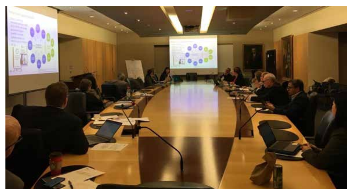
Discussions taking place between the UK delegation and colleagues at the University Health Network in Toronto

funded through the government's Canada First Research Excellence Fund<sup>94</sup>. Alongside research funding, it works to support clinical translation and commercialisation. With an international mandate, the delegation learned that 50% of their international collaborations are with UK groups. This highlighted the strong appetite for UK-Canada academic partnerships in the advanced therapies area, which will underpin long-term innovation collaboration.