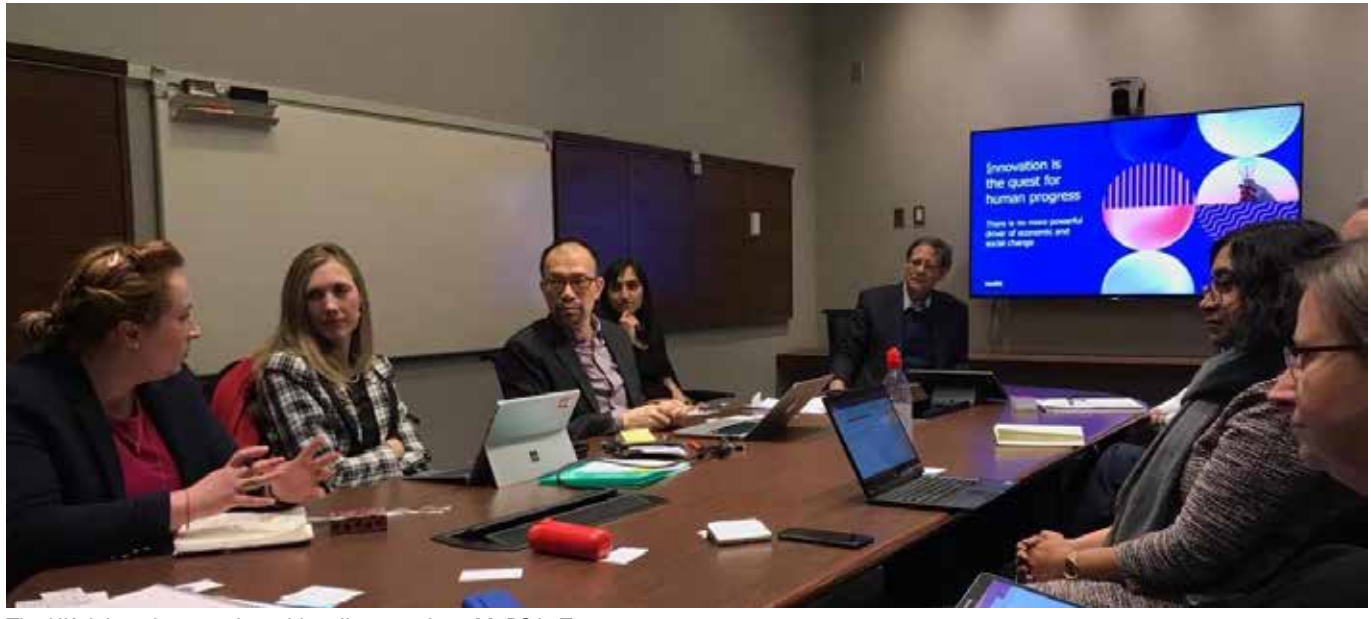
The UK delegation meeting with colleagues from MaRS in Toronto

SCN has generated a detailed landscape map of the Canadian regenerative medicine ecosystem (see Figure 1, page 8), for use to advocate for the sector and signpost for interactions. This could be used to help identify where it makes sense for the UK and Canada to collaborate. Additional networks and infrastructure that the delegation did not meet with, but which play an essential role in supporting ATMP research and innovation in Canada include the Canadian Institutes of Health Research (CIHR)<sup>86</sup>, the Centre for Drug Research and Development (CDRD)<sup>87</sup>, the National Public Cord Blood Bank<sup>88</sup>, the Canadian National Transplant Research Program<sup>89</sup>, and the Institute for Research in Immunology and Cancer - Commercialization of Research (IRICoR)90. The Council of Canadian Academies report provides more in-depth information on this summary<sup>91</sup>.