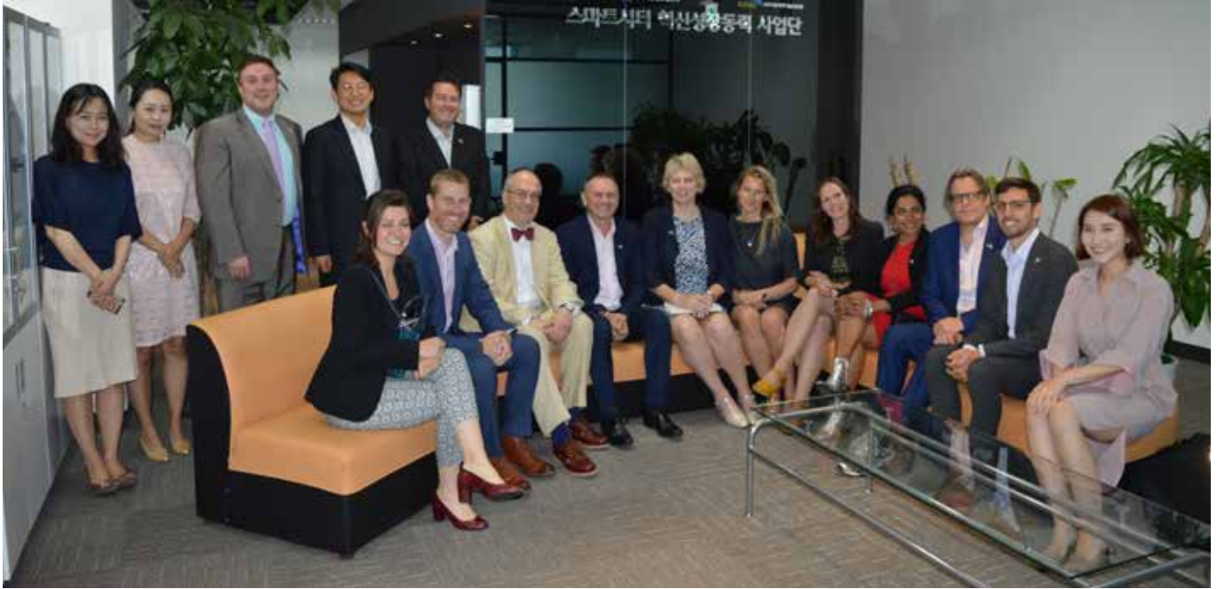
Meeting with KAIA

During the mission, discussions regarding the data hub, digital twin and data governance suggested that the Korean approach was still relatively immature. Some of the information management work being undertaken in support of the Digital Framework Task Group in the UK, for example, could offer considerable benefits to the Koreans and also enable the UK to test its concepts in a receptive market. Aligned to this, the UK is significantly engaged with the wider debate about data ethics and trust and the use of citizen's data. Each area represents significant scope for UK-Korea collaboration.