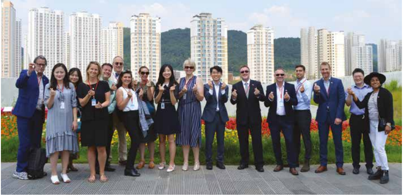
Meeting in Sejong

be for companies validating and demonstrating their services in their testbed, apart from the regulatory sandbox. In addition, the Sejong Smart City project team is actively trying to identify UK start-ups interested in demonstrating their products and services in Sejong's testbed. However, the offer for the companies is yet to be defined.