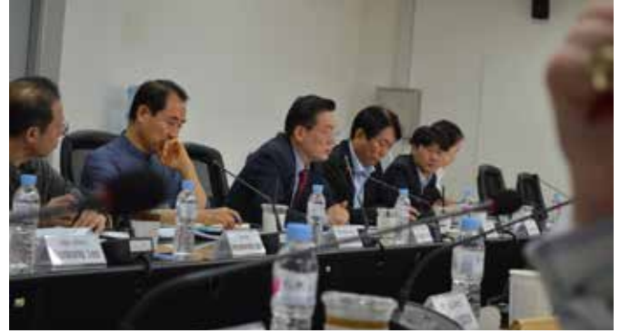
Meeting with the PCFIR